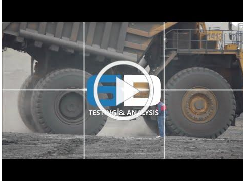
6D in 60 Seconds