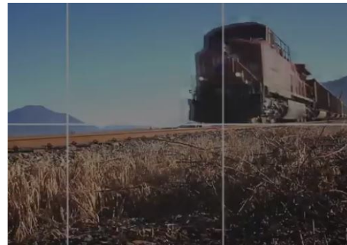
Video: Product Validation Field Testing