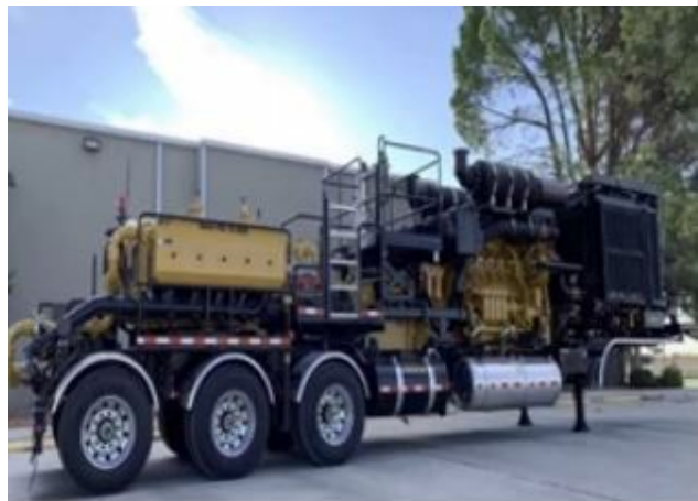
Video: Assisted Testing